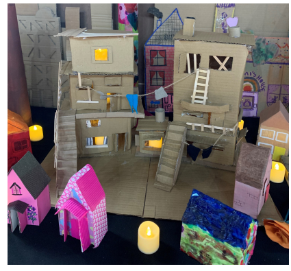
Some Close-ups of